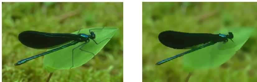
Figure 3. (a) Original image. (b) Mean shift filtering result.